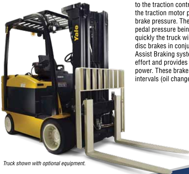
Truck shown with optional equipment.